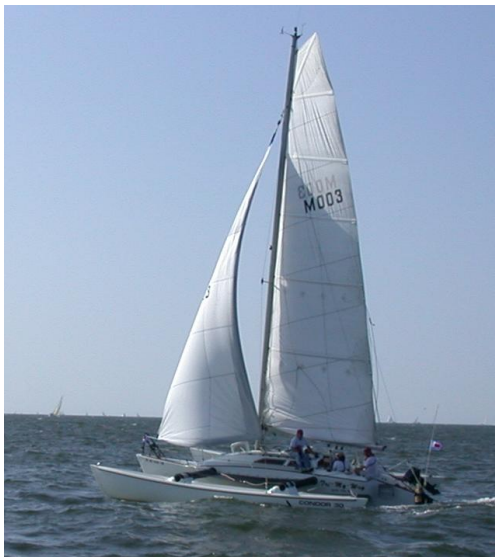
Condor 30 Tri My Way

(larger photo available on CCMA website)