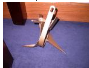
The dreaded BENT ANCHOR AWARD