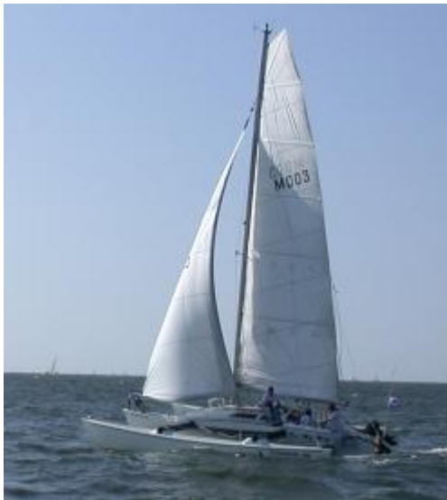
Condor 30 Tri My Way

Hull # 3. 1990. Ready for racing or cruising. Fast, strong and comfortable trimaran in excellent condition. Two complete sets of main sails w/Furlex furling jib. 2002 upgrades include UK spinnaker, Sunrise Side Nets, and Lewmar running gear/traveler. Electronics: VHF, Loran, Multi function instruments (Wind, Depth, Speed) w/Sailcom, AM/FM radio, and solar panel/system. Engine: Nissan 9.9. Sea Lyon Two Axle Boat Trailer. May hold Note - $10,000 down. Boat Slip available. $45,000. Contact: Dave Way, 202-685-5368, or email; daveway@chESApeake.net