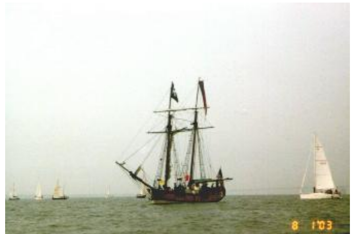
The Pride of Baltimore II acting as race committee in 2003.

I want to thank all who contributed to this newsletter. It sure makes this job easier when material doesn't have to be fabricated!