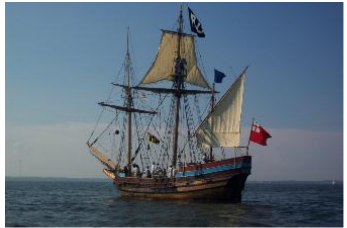
The Maryland Dove starting the 2002 Governor's Cup.