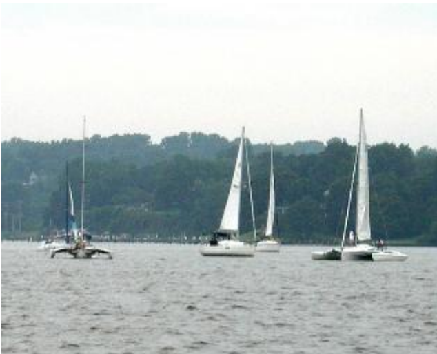
Multihulls waiting for their class to start the Solomon's Invitational.