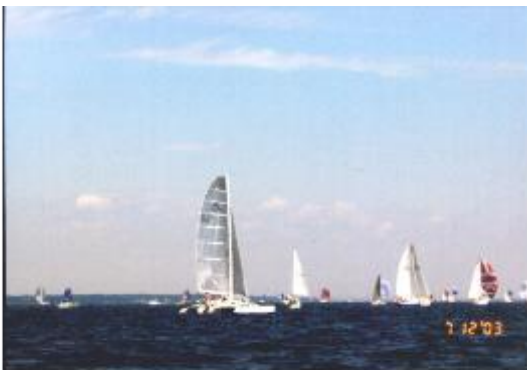
Start of Baltimore Sail for Sight Right - Trinity crew at the 2003 Governor's Cup